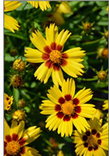
Sunkiss Tickseed flowers