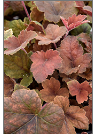
Pumpkin Spice Foamy Bells foliage

Pumpkin Spice Foamy Bells is recommended for the following landscape applications;