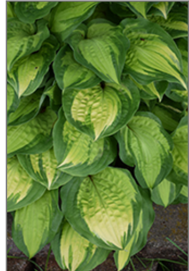
Island Breeze Hosta foliage

This is a relatively low maintenance plant, and is best cleaned up in early spring before it resumes active growth for the season. Gardeners should be aware of the following characteristic(s) that may warrant special consideration;