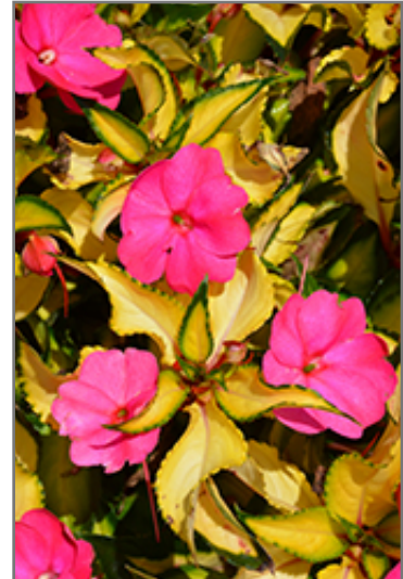
SunPatiens Compact Tropical Rose New Guinea Impatiens flowers

SunPatiens Compact Tropical Rose New Guinea Impatiens is a dense herbaceous annual with a mounded form. Its medium texture blends into the garden, but can always be balanced by a couple of finer or coarser plants for an effective composition.