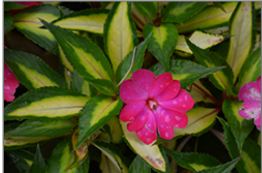
SunPatiens Compact Tropical Rose New Guinea Impatiens flowers