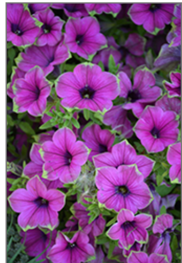
Supertunia Picasso In Purple Petunia flowers