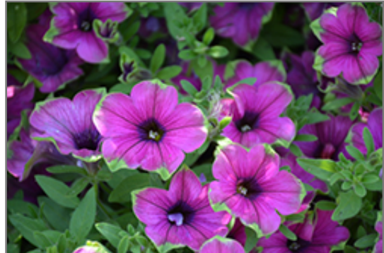
Supertunia Picasso In Purple Petunia flowers

Supertunia Picasso In Purple Petunia is a dense herbaceous annual with a trailing habit of growth, eventually spilling over the edges of hanging baskets and containers. Its medium texture blends into the garden, but can always be balanced by a couple of finer or coarser plants for an effective composition.