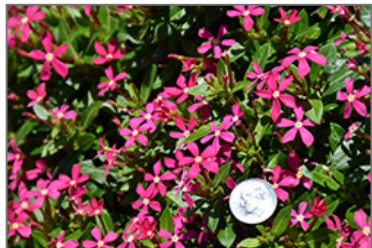
Soiree Kawaii Coral Vinca flowers