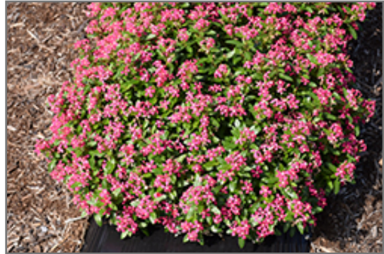
Soiree Kawaii Coral Vinca in bloom

Soiree Kawaii Coral Vinca is a fine choice for the garden, but it is also a good selection for planting in outdoor containers and hanging baskets. Because of its trailing habit of growth, it is ideally suited for use as a 'spiller' in the 'spiller-thriller-filler' container combination; plant it near the edges where it can spill gracefully over the pot. Note that when growing plants in outdoor containers and baskets, they may require more frequent waterings than they would in the yard or garden.