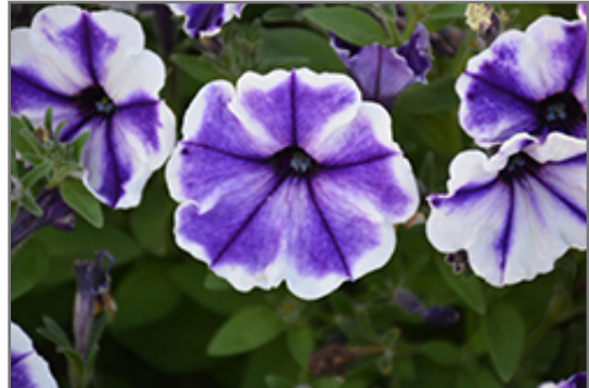
Crazytunia Blue Ice Petunia flowers

Crazytunia Blue Ice Petunia is recommended for the following landscape applications;