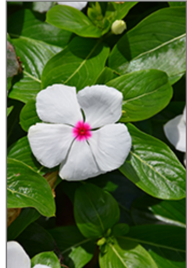
Mega Bloom Polka Dot Vinca flowers

Mega Bloom Polka Dot Vinca is recommended for the following landscape applications;