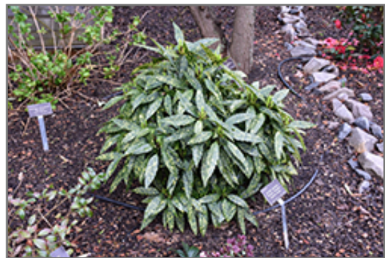
Hosoba Hoshifu Aucuba