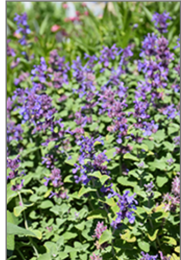
Early Bird Catmint flowers

Early Bird Catmint is recommended for the following landscape applications;