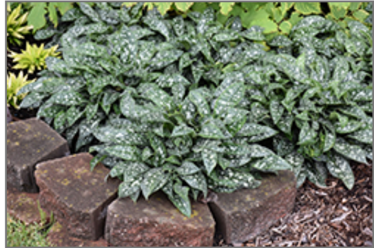
Twinkle Toes Lungwort

Twinkle Toes Lungwort will grow to be about 12 inches tall at maturity, with a spread of 18 inches. When grown in masses or used as a bedding plant, individual plants should be spaced approximately 15 inches apart. Its foliage tends to remain dense right to the ground, not requiring facer plants in front. It grows at a medium rate, and under ideal conditions can be expected to live for approximately 10 years. As an herbaceous perennial, this plant will usually die back to the crown each winter, and will regrow from the base each spring. Be careful not to disturb the crown in late winter when it may not be readily seen!