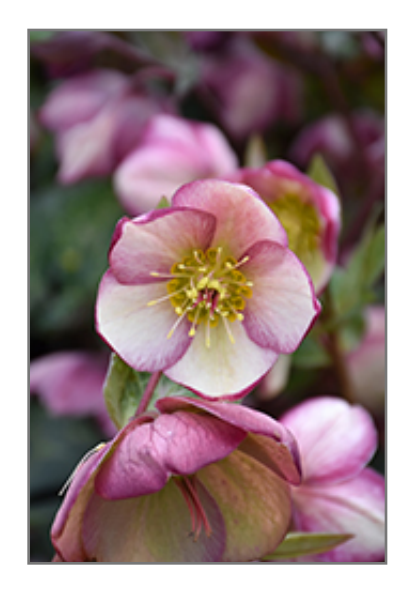
Frostkiss Glenda's Gloss Hellebore flowers