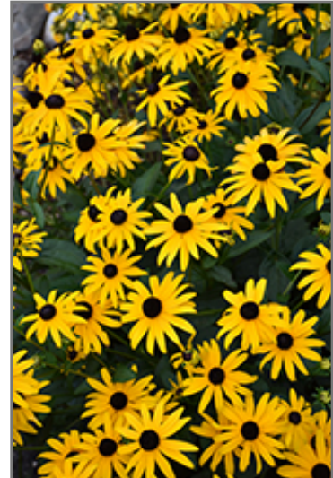
American Gold Rush Coneflower flowers

American Gold Rush Coneflower is an herbaceous perennial with an upright spreading habit of growth. Its medium texture blends into the garden, but can always be balanced by a couple of finer or coarser plants for an effective composition.