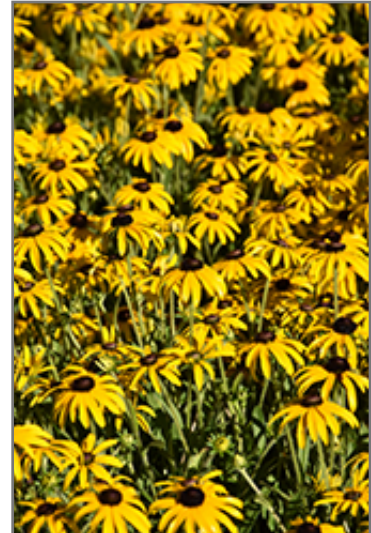
American Gold Rush Coneflower flowers

American Gold Rush Coneflower is a fine choice for the garden, but it is also a good selection for planting in outdoor pots and containers. With its upright habit of growth, it is best suited for use as a 'thriller' in the 'spiller-thriller-filler' container combination; plant it near the center of the pot, surrounded by smaller plants and those that spill over the edges. Note that when growing plants in outdoor containers and baskets, they may require more frequent waterings than they would in the yard or garden.