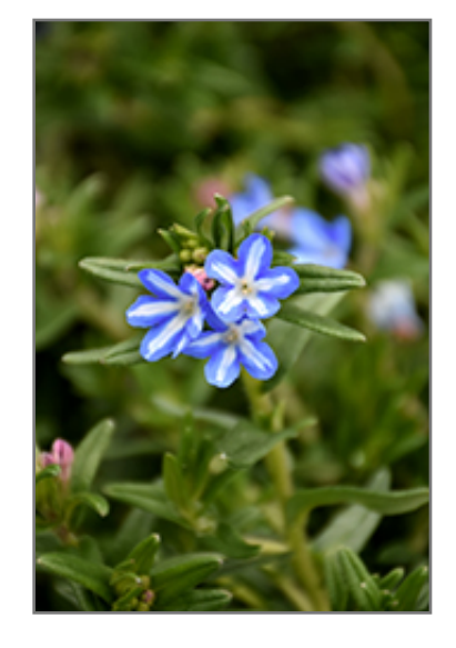
White Star Lithodora flowers