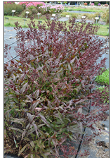
Pocahontas Beard Tongue

Pocahontas Beard Tongue is an herbaceous perennial with an upright spreading habit of growth. Its medium texture blends into the garden, but can always be balanced by a couple of finer or coarser plants for an effective composition.