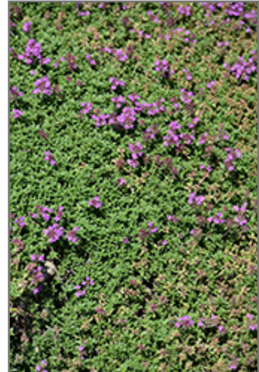
Creeping Thyme in bloom

Creeping Thyme is recommended for the following landscape applications;