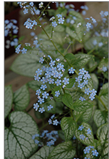
Jack Frost Bugloss flowers