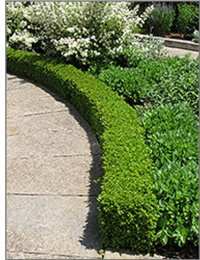
Green Velvet Boxwood

Green Velvet Boxwood makes a fine choice for the outdoor landscape, but it is also well-suited for use in outdoor pots and containers. Because of its height, it is often used as a 'thriller' in the 'spiller-thriller-filler' container combination; plant it near the center of the pot, surrounded by smaller plants and those that spill over the edges. It is even sizeable enough that it can be grown alone in a suitable container. Note that when grown in a container, it may not perform exactly as indicated on the tag - this is to be expected. Also note that when growing plants in outdoor containers and baskets, they may require more frequent waterings than they would in the yard or garden.