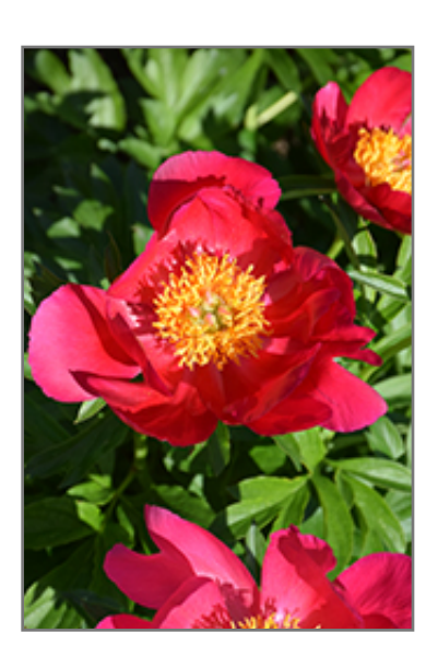
Scarlet O'Hara Peony flowers

Scarlet O'Hara Peony will grow to be about 30 inches tall at maturity, with a spread of 3 feet. When grown in masses or used as a bedding plant, individual plants should be spaced approximately 30 inches apart. The flower stalks can be weak and so it may require staking in exposed sites or excessively rich soils. It grows at a slow rate, and under ideal conditions can be expected to live for approximately 20 years. As an herbaceous perennial, this plant will usually die back to the crown each winter, and will regrow from the base each spring. Be careful not to disturb the crown in late winter when it may not be readily seen!