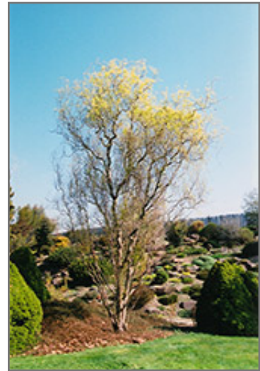
Dragon's Claw Willow in winter