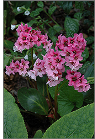
Pink Dragonfly Bergenia flowers

Pink Dragonfly Bergenia is recommended for the following landscape applications;