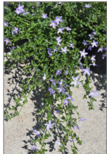
Blue Waterfall Serbian Bellflower in bloom