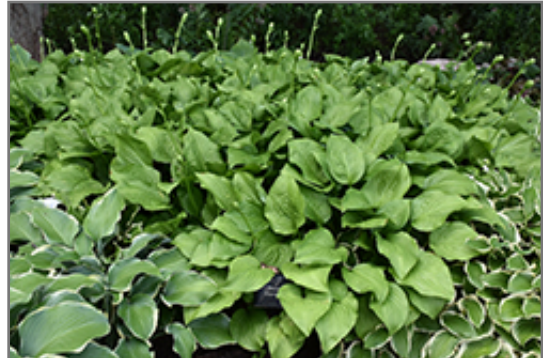
Royal Standard Hosta