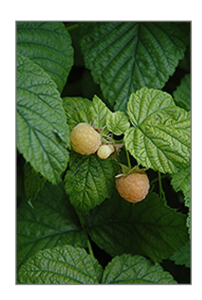
Fall Gold Raspberry fruit

This is an open multi-stemmed deciduous shrub with an upright spreading habit of growth. Its relatively coarse texture can be used to stand it apart from other landscape plants with finer foliage. This is a high maintenance plant that will require regular care and upkeep. Each spring, cut back all dead and two-year old canes to the ground, leaving only last year's growth standing. It is a good choice for attracting birds to your yard. Gardeners should be aware of the following characteristic(s) that may warrant special consideration;