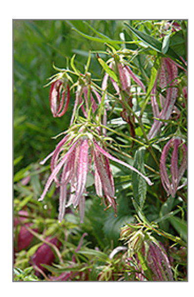
Pink Octopus Bellflower flowers