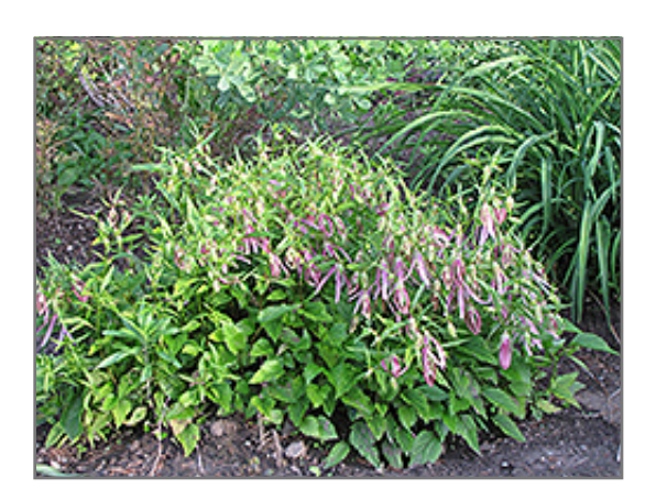
Pink Octopus Bellflower in bloom