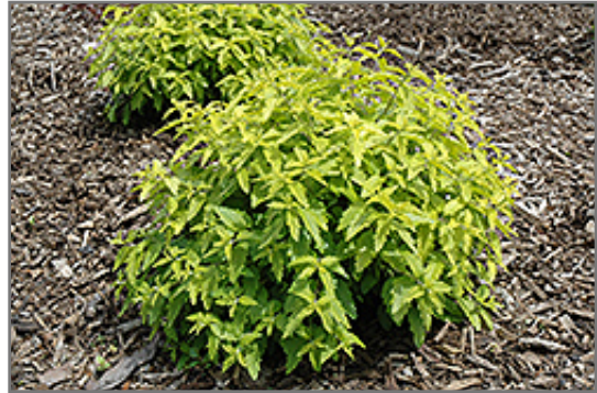
Sunshine Blue Caryopteris

Sunshine Blue Caryopteris is recommended for the following landscape applications;