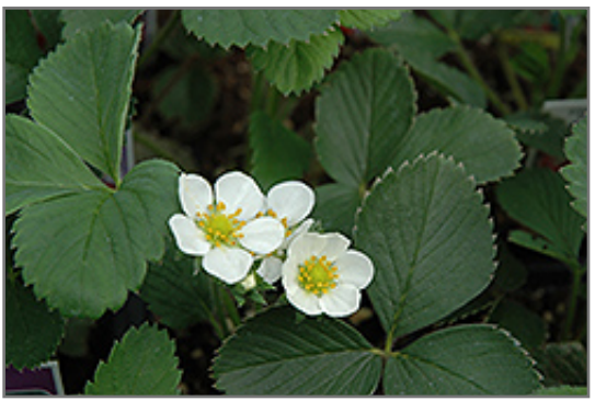
Allstar Strawberry flowers

Allstar Strawberry features dainty white daisy flowers with yellow eyes along the stems in mid spring. Its tomentose round compound leaves remain green in color throughout the season. It features an abundance of magnificent cherry red berries in early summer.