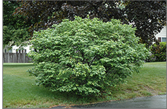
Compact Winged Burning Bush

Compact Winged Burning Bush will grow to be about 7 feet tall at maturity, with a spread of 7 feet. It tends to fill out right to the ground and therefore doesn't necessarily require facer plants in front, and is suitable for planting under power lines. It grows at a slow rate, and under ideal conditions can be expected to live for 50 years or more.