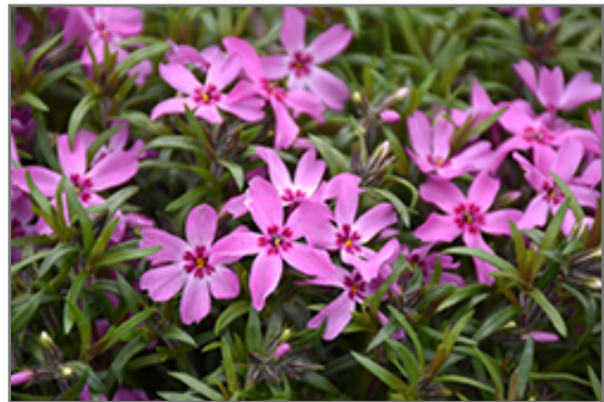
Crimson Beauty Moss Phlox flowers