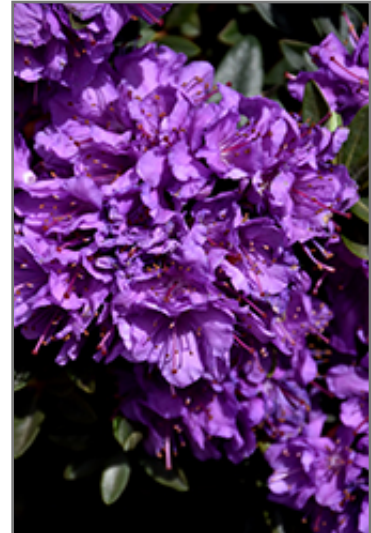
Purple Gem Rhododendron flowers

Purple Gem Rhododendron is recommended for the following landscape applications;