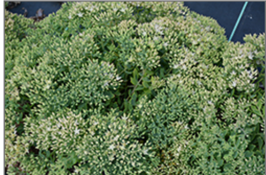
Thundercloud Stonecrop flower buds