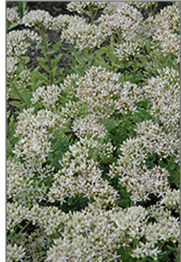
Thundercloud Stonecrop flowers

Thundercloud Stonecrop is a dense herbaceous perennial with a mounded form. Its relatively fine texture sets it apart from other garden plants with less refined foliage.