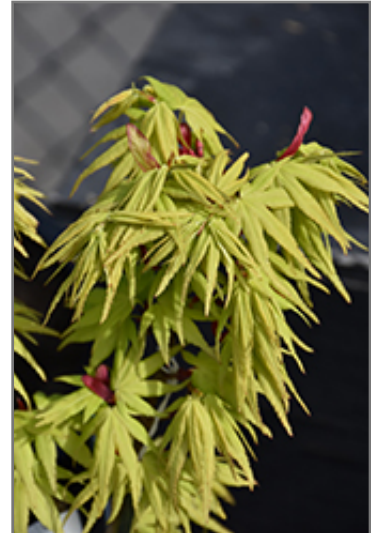
Mikawa Yatsubusa Japanese Maple foliage

Mikawa Yatsubusa Japanese Maple is recommended for the following landscape applications;