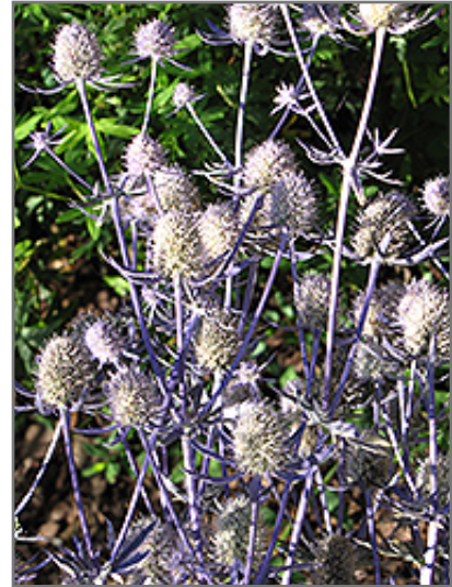
Jade Frost Variegated Sea Holly flowers

Jade Frost Variegated Sea Holly is a fine choice for the garden, but it is also a good selection for planting in outdoor pots and containers. It can be used either as 'filler' or as a 'thriller' in the 'spiller-thriller-filler' container combination, depending on the height and form of the other plants used in the container planting. Note that when growing plants in outdoor containers and baskets, they may require more frequent waterings than they would in the yard or garden.