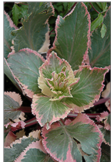
Jade Frost Variegated Sea Holly foliage