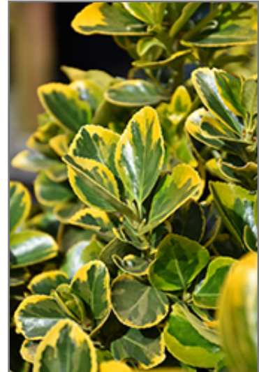
Gold Variegated Japanese Euonymus foliage

Gold Variegated Japanese Euonymus is recommended for the following landscape applications;