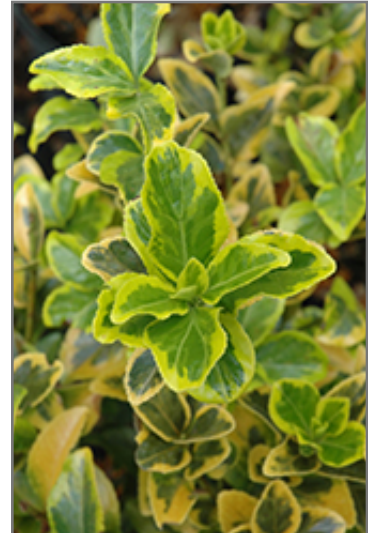
Gold Variegated Japanese Euonymus foliage