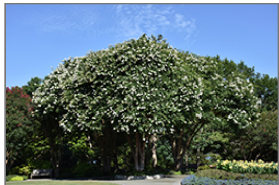
Natchez Crapemyrtle in bloom