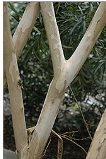
Zuni Crapemyrtle bark

Zuni Crapemyrtle makes a fine choice for the outdoor landscape, but it is also well-suited for use in outdoor pots and containers. Because of its height, it is often used as a 'thriller' in the 'spiller-thriller-filler' container combination; plant it near the center of the pot, surrounded by smaller plants and those that spill over the edges. It is even sizeable enough that it can be grown alone in a suitable container. Note that when grown in a container, it may not perform exactly as indicated on the tag - this is to be expected. Also note that when growing plants in outdoor containers and baskets, they may require more frequent waterings than they would in the yard or garden.