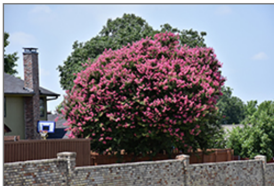
Zuni Crape Myrtle in bloom