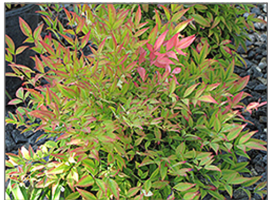
Moon Bay Dwarf Nandina