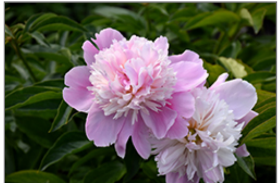
Monsieur Jules Elie Peony flowers