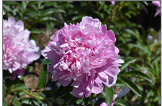
Monsieur Jules Elie Peony flowers

Monsieur Jules Elie Peony is recommended for the following landscape applications;