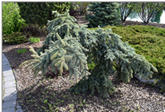
Weeping Blue Spruce