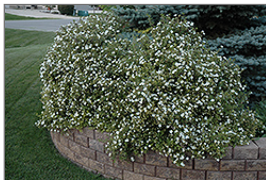
Abbotswood Potentilla in bloom