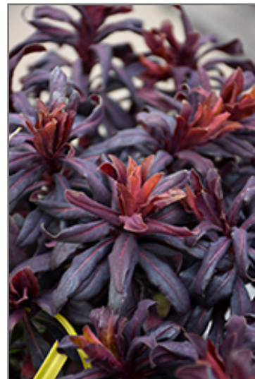
Ruby Glow Wood Spurge flowers

This is a relatively low maintenance plant, and should only be pruned after flowering to avoid removing any of the current season's flowers. Deer don't particularly care for this plant and will usually leave it alone in favor of tastier treats. It has no significant negative characteristics.