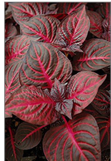
Blazin' Rose Blood Leaf foliage