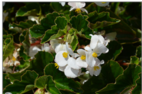
BabyWing White Begonia flowers