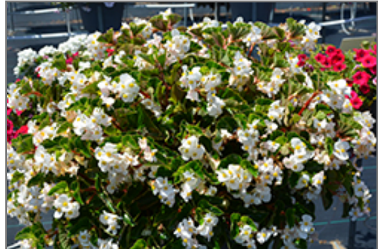
BabyWing White Begonia in bloom

BabyWing White Begonia is a fine choice for the garden, but it is also a good selection for planting in outdoor containers and hanging baskets. It is often used as a 'filler' in the 'spiller-thriller-filler' container combination, providing a mass of flowers and foliage against which the thriller plants stand out. Note that when growing plants in outdoor containers and baskets, they may require more frequent waterings than they would in the yard or garden.