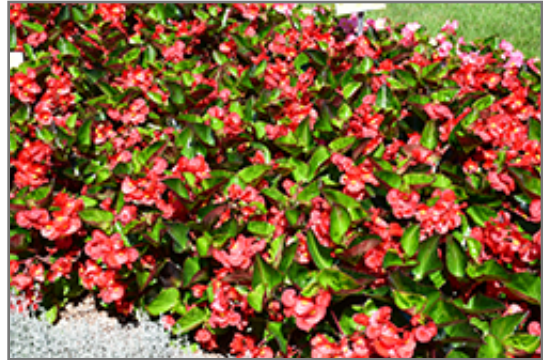
Big Red Green Leaf Begonia in bloom

Big Red Green Leaf Begonia is a fine choice for the garden, but it is also a good selection for planting in outdoor containers and hanging baskets. It is often used as a 'filler' in the 'spiller-thriller-filler' container combination, providing a mass of flowers and foliage against which the larger thriller plants stand out. Note that when growing plants in outdoor containers and baskets, they may require more frequent waterings than they would in the yard or garden.