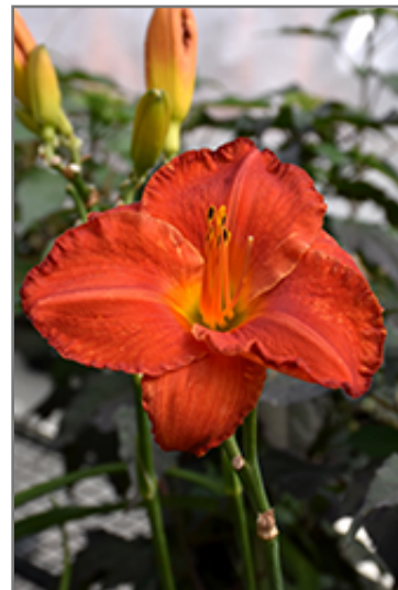
Desert Flame Daylily flowers