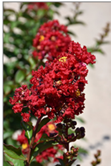
Enduring Summer Red Crapemyrtle flowers