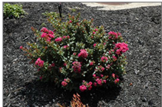
Berry Dazzle Crapemyrtle in bloom