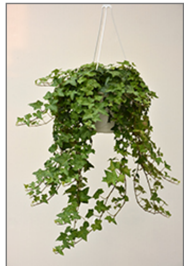
English Ivy