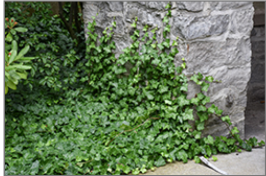
English Ivy

English Ivy will grow to be about 8 inches tall at maturity, with a spread of 20 feet. As a climbing vine, it tends to be leggy near the base and should be underplanted with low-growing facer plants. It should be planted near a fence, trellis or other landscape structure where it can be trained to grow upwards on it, or allowed to trail off a retaining wall or slope. It grows at a fast rate, and under ideal conditions can be expected to live for approximately 30 years.