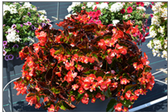
BabyWing Red Begonia in bloom