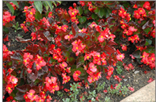
BabyWing Red Begonia flowers

BabyWing Red Begonia is an herbaceous annual with a mounded form. Its medium texture blends into the garden, but can always be balanced by a couple of finer or coarser plants for an effective composition.