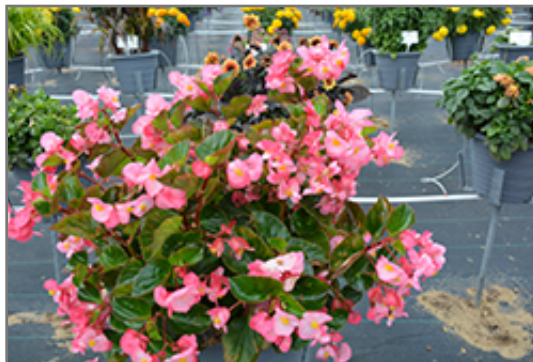
Big Pink Green Leaf Begonia in bloom

Big Pink Green Leaf Begonia is a fine choice for the garden, but it is also a good selection for planting in outdoor containers and hanging baskets. It is often used as a 'filler' in the 'spiller-thriller-filler' container combination, providing a mass of flowers and foliage against which the larger thriller plants stand out. Note that when growing plants in outdoor containers and baskets, they may require more frequent waterings than they would in the yard or garden.