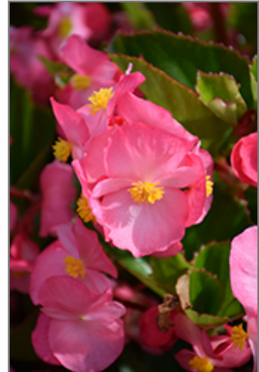
Big Pink Green Leaf Begonia flowers

Big Pink Green Leaf Begonia is an herbaceous annual with an upright spreading habit of growth. Its medium texture blends into the garden, but can always be balanced by a couple of finer or coarser plants for an effective composition.